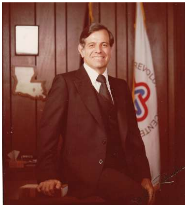
Louisiana State Senator Fritz H. Windhorst District 7 (February 1988). (Photo release from photographer Sonny Randon available upon request).